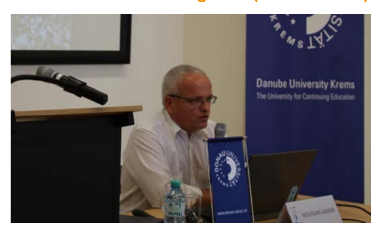
Lecture by Wolfgang Amann

Focused on the informal housing scenario in the context of Montenegro whose geographic terrain is interesting because of the hills and poses a challenge where illegal housing is built not for reasons of "poverty" but for the reasons of Land capture especially on lands with scenic vistas, This session helped understand the practices of "Spatial Urbanistic Plan" and Detail Urban Plan. The issue of illegality of housing structures and regulatory frameworks that govern such informal housing. The detail plan to lay infrastructure like Road was also presented which is similar in case of India and could be related.