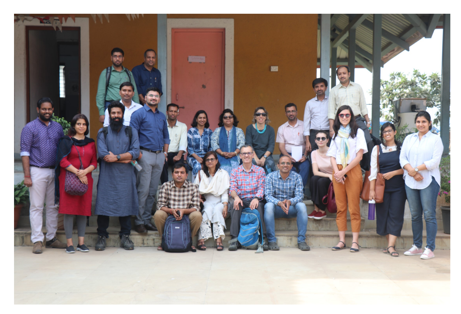
Visit to the M-Ward by BReUCOM Participants