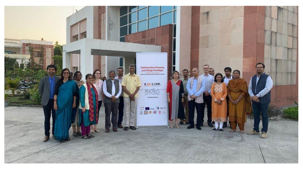
Participants of the BReUCOM Symposium 4, Bhopal