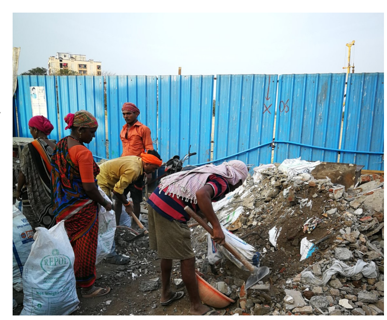
Residents within M-ward cleaning their locality

Amita Bhide emphasized on the intersection between the socially excluded and environmental vulnerability, explaining how the impoverished, and the marginalized are pushed to the city's periphery in M ward, to inhabit one of the low-lying, vulnerable areas. The site visit revealed the plights faced by the inhabitants of the M Ward, and their struggles against the establishment to procure water. M Ward provides a risky but inevitable option for the immigrants from various parts of the country heading to Mumbai for a better life. Not only can local power elites strive to concentrate "unwanted" people in specific areas of a city but also "unwanted" functions.